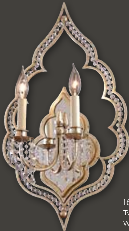
161-12 Two Light Sconce W 13½" H 23" EXT 5½" mm: W 343 H 584 EXT 140 2 / 60 C