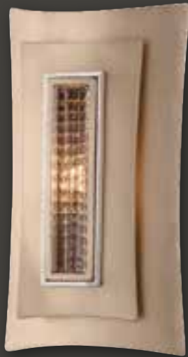
155-11 One Light ADA Sconce W 7" H 12" EXT 3 1/2" mm: W 178 H 305 EXT 89 1 / 60 C