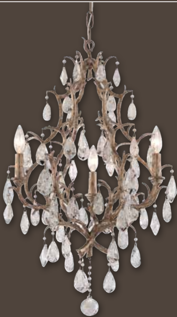
163-03 Three Light Chandelier W 20" H 30½" mm: W 508 H 775 3 / 60 C