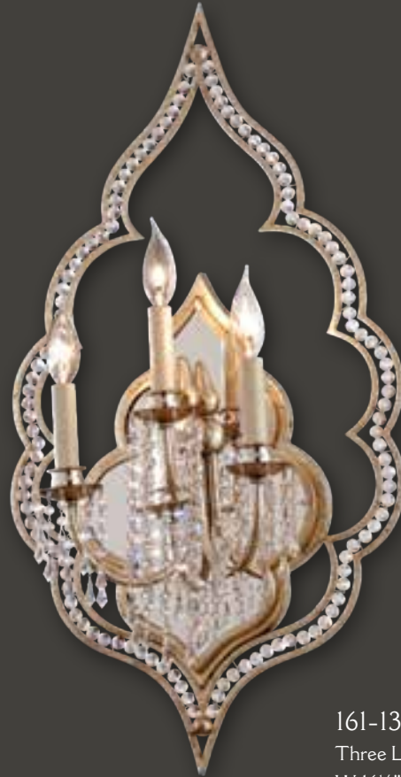
161-13 Three Light Sconce W 16½" H 29" EXT 6½" mm: W 419 H 737 EXT 165 3 / 60 C

Hand-Crafted Iron Silver Leaf Finish with Antique Mist Crystal Accents