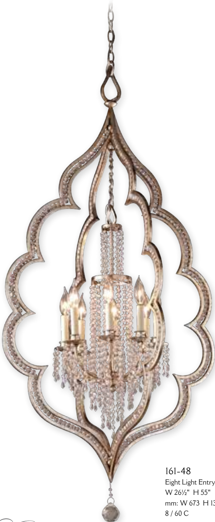
161-48 Eight Light Entry W 26½" H 55" mm: W 673 H 1397 8 / 60 C