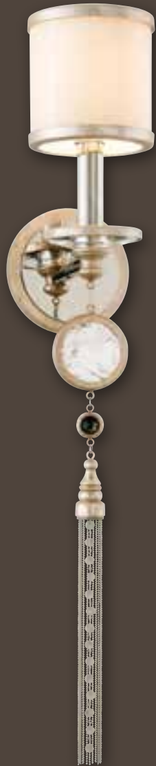
162-11 One Light Sconce W 4¼" H 25" EXT 4¾" mm: W 108 H 635 EXT 121 1 / 60 C