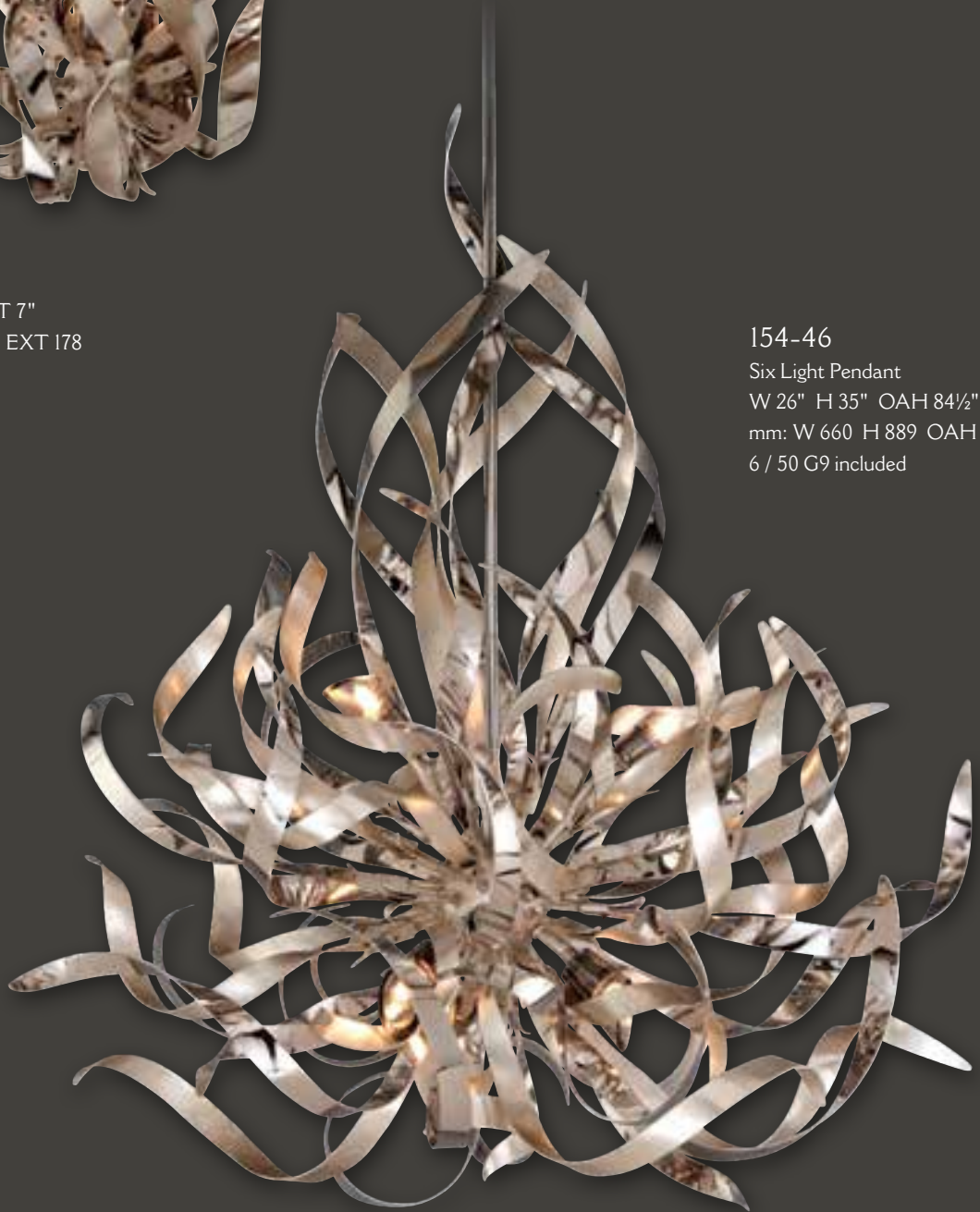
154-46 Six Light Pendant W 26" H 35" OAH 84½" mm: W 660 H 889 OAH 2146 6 / 50 G9 included

Hand-Crafted Iron Silver Leaf and Polished Stainless Finish Smoked Crystal Diffuser 1-6", 2-12", 1-18" Stems with Hang-Straight Canopy mm: 1-152, 2-305, 1-457