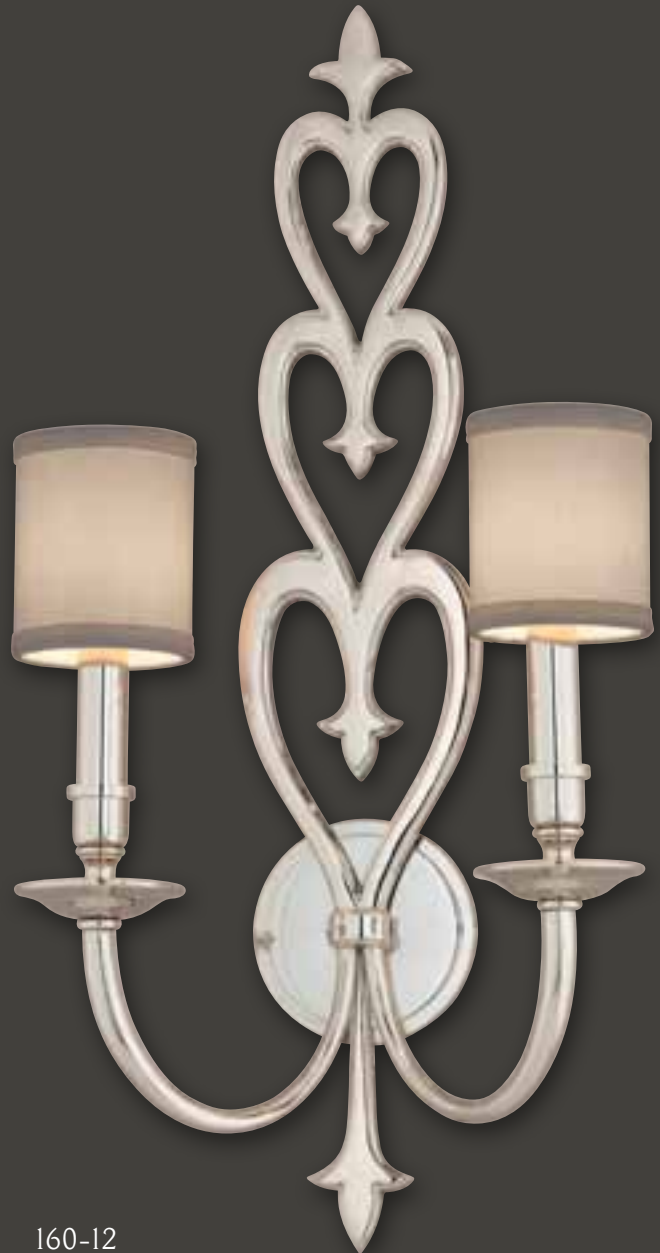
160-12 Two Light Sconce W 12 1 / 2 " H 25 1 / 4 " EXT 6 1 / 2 " mm: W 318 H 641 EXT 165 2 / 40 C

Solid Brass Polished Nickel Finish Hardback Linen Shade