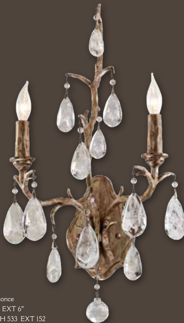
163-12 Two Light Sconce W 11" H 21" EXT 6" mm: W 279 H 533 EXT 152 2 / 60 C