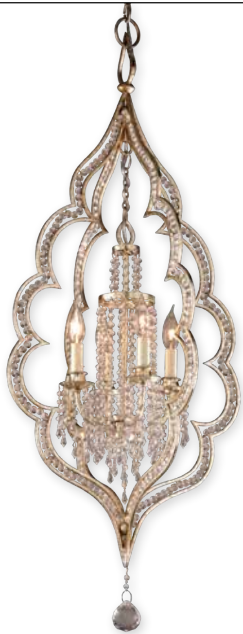
161-44 Four Light Entry W 20½" H 41½" mm: W 521 H 1054 4 / 60 C