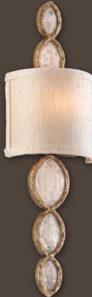
167-11 One Light ADA Sconce W 6½" H 20½" EXT 3½" mm: W 165 H 521 EXT 89 1 / 40 C