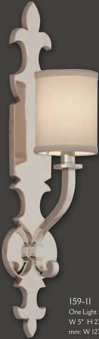
159-11 One Light Sconce W 5" H 23 3 / 4 " EXT 6 1 / 2 " mm: W 127 H 603 EXT 165 1 / 60 C