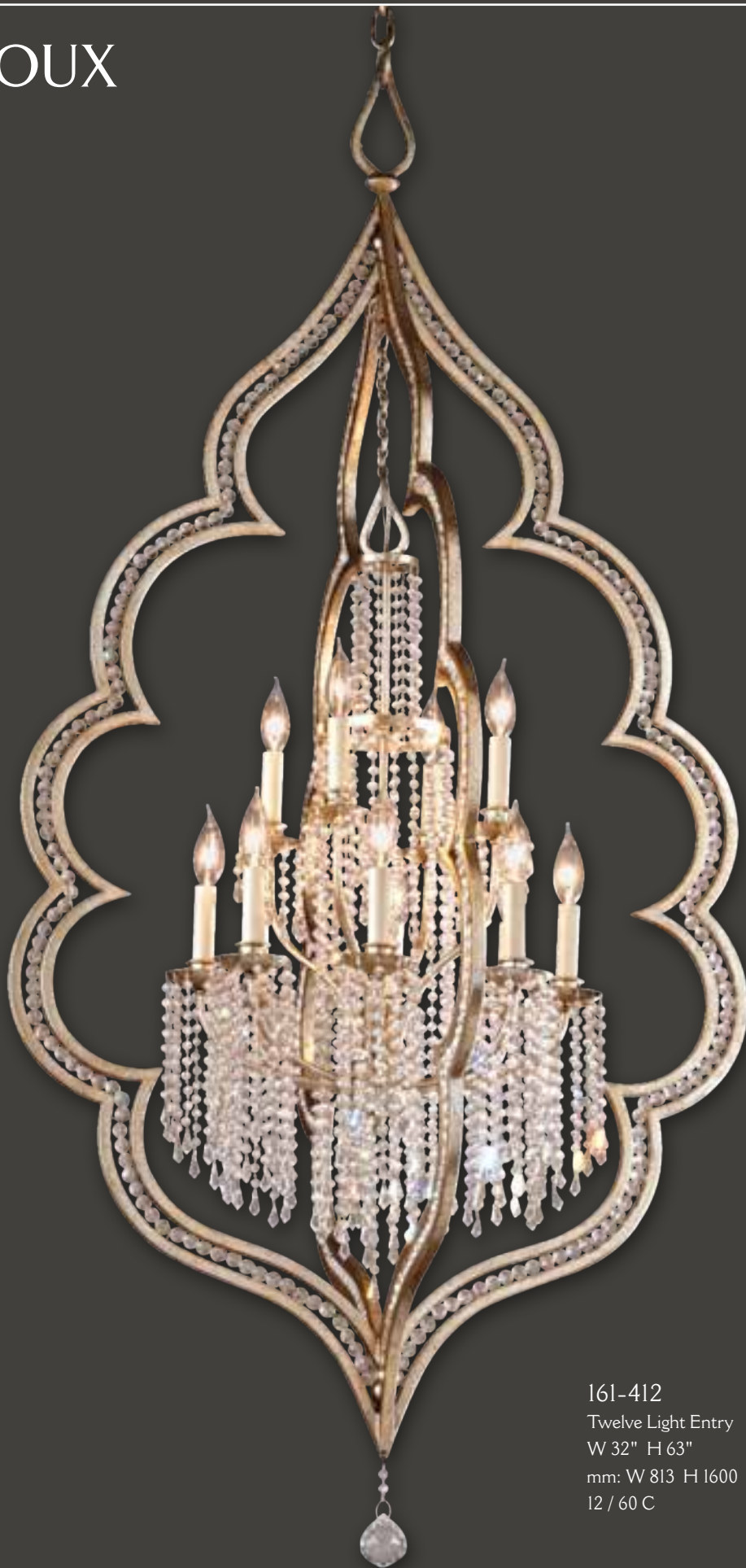
161-412 Twelve Light Entry W 32" H 63" mm: W 813 H 1600 12 / 60 C