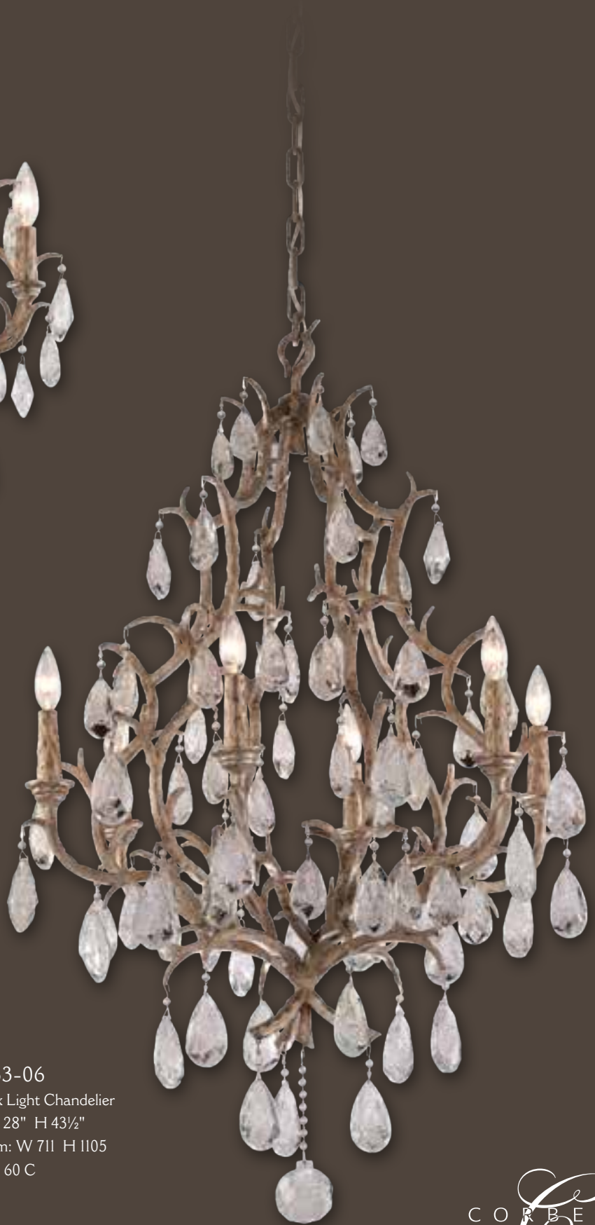
163-06 Six Light Chandelier W 28" H 43½" mm: W 711 H 1105 6 / 60 C

Hand-Crafted Iron Vienna Bronze Finish Italian Drops