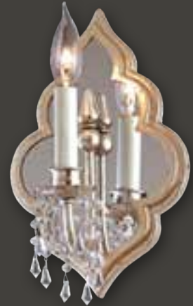
161-11 One Light Sconce W 7½" H 11¾" EXT 5½" mm: W 191 H 298 EXT 140 1 / 60 C