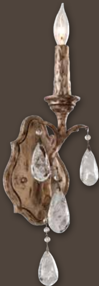
163-11 One Light Sconce W 5" H 16½" EXT 4" ADA OAH with lamp 19¼" mm: W 127 H 419 EXT 108 OAH with lamp 489 1 / 60 C