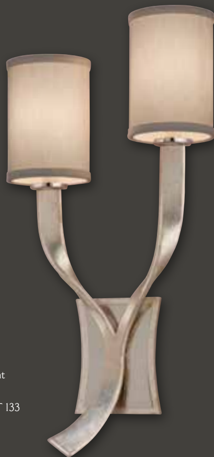
158-12 Two Light Sconce – Right W 12" H 24" EXT 5¼" mm: W 305 H 610 EXT 133 2 / 60 C