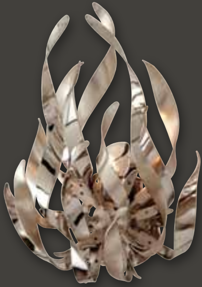
154-11 One Light Sconce W 10" H 15½" EXT 7" mm: W 254 H 394 EXT 178 1 / 50 G9 included