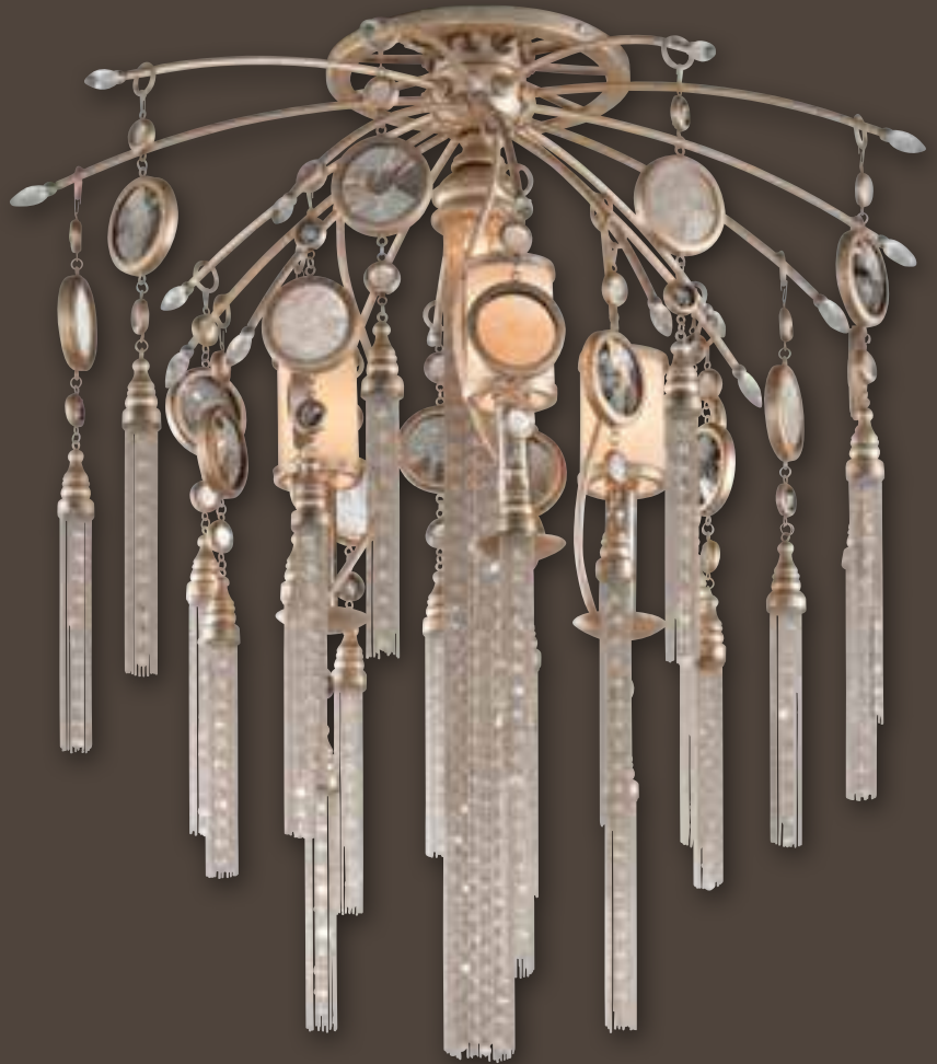
162-37 Six + One Light Semi-flush W 26" H 28" mm: W 660 H 711 6 / 60 C + 1 / 50 G9 included

Hand-Crafted Iron Topaz Leaf Finish White Pearl Glass Shade Brazilian Rock Crystal with Smoked Crystal Medallions Nickel and Crystal Tassels