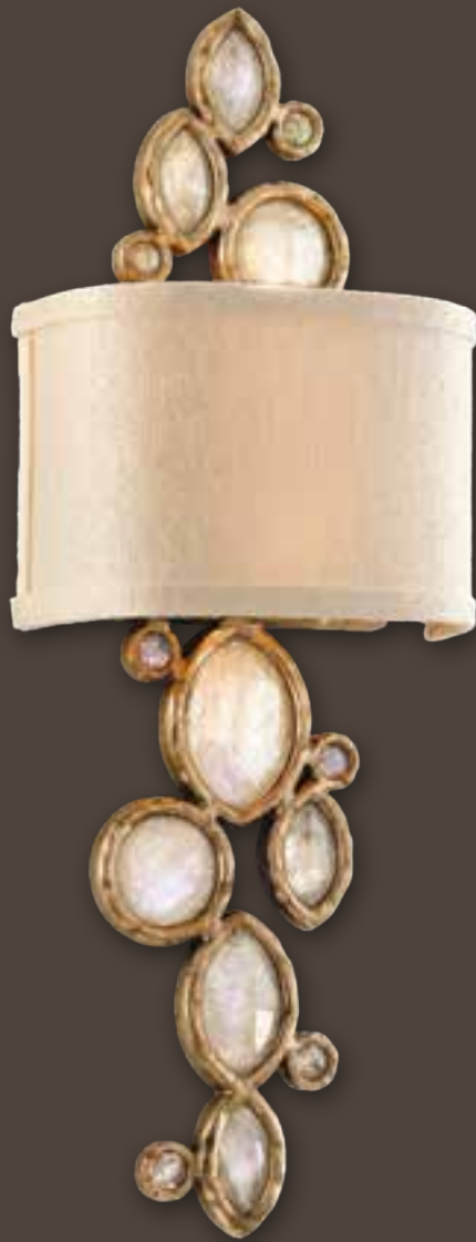
167-12 Two Light ADA Sconce W 8½" H 23¼" EXT 3½" mm: W 216 H 591 EXT 89 2 / 40 C