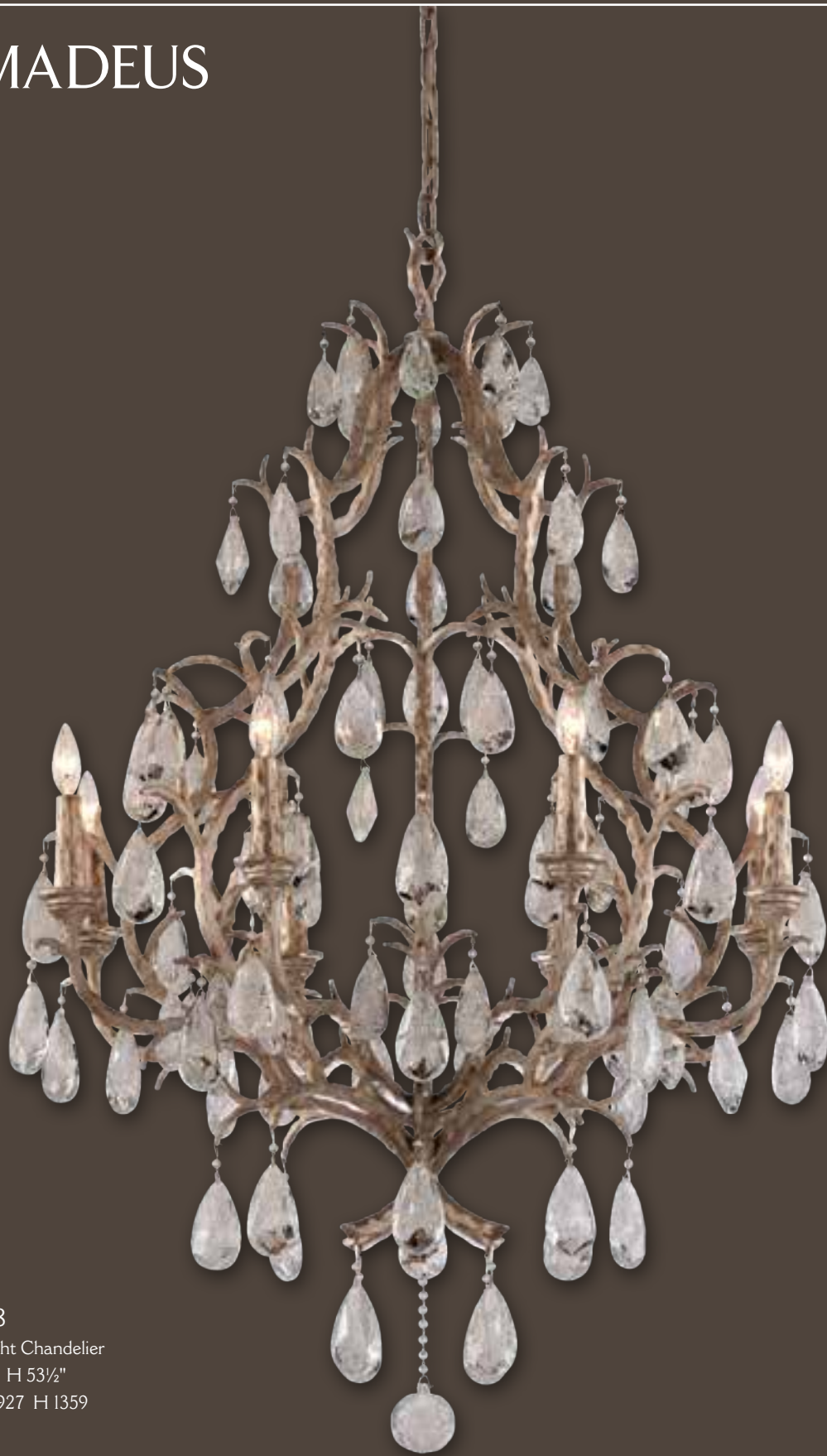
163-08 Eight Light Chandelier W 36½" H 53½" mm: W 927 H 1359 8 / 60 C