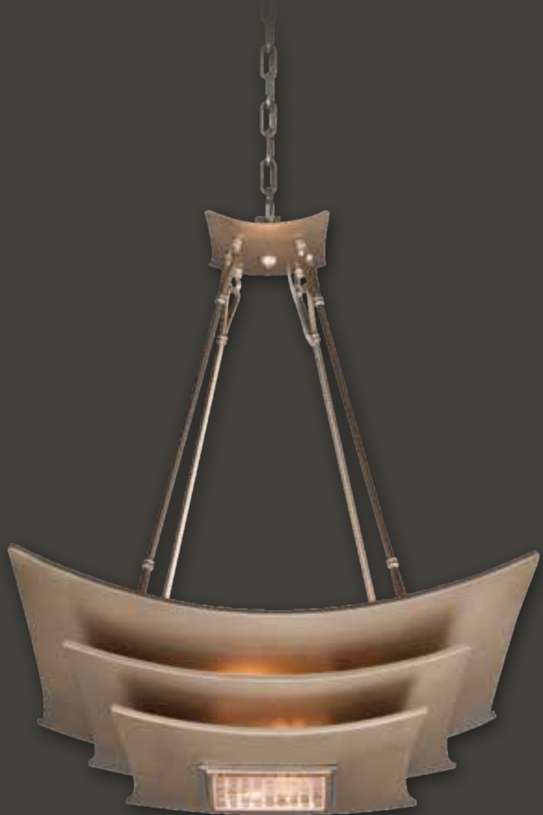
155-44 Four Light Pendant L 23" W 23" H 28" mm: L 584 W 584 H 711 4 / 60 C