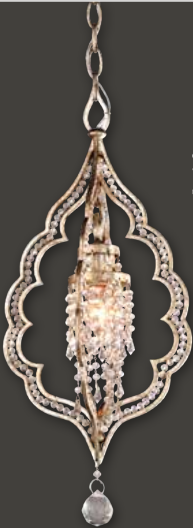
161-41 One Light Pendant W 10" H 24¼" mm: W 254 H 616 1 / 60 M