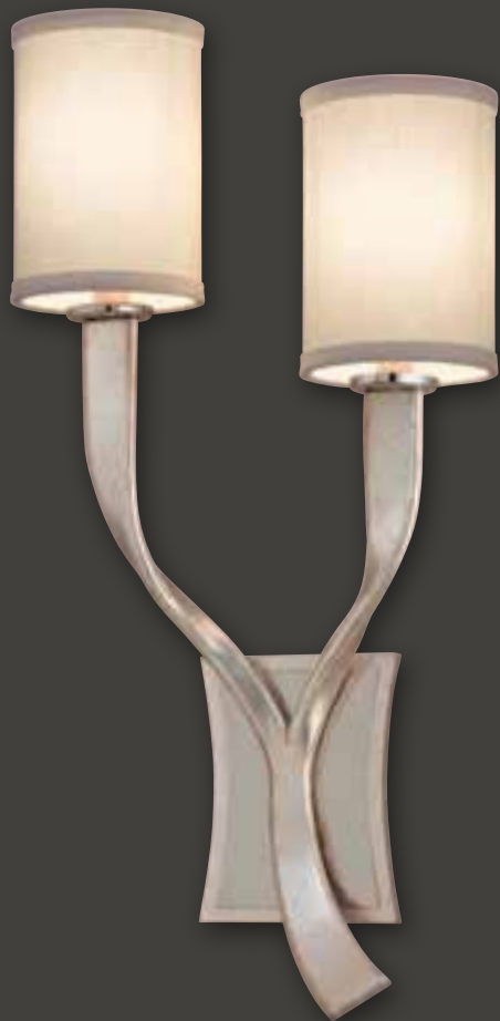
158-11 Two Light Sconce – Left W 12" H 24" EXT 5¼" mm: W 305 H 610 EXT 133 2 / 60 C