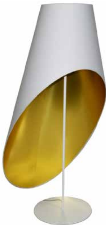
3 Light Slanted Tapered Drum Floor, Wht/Gld Shade

Height 58 Width/Length 36 Depth 36 Weight 12