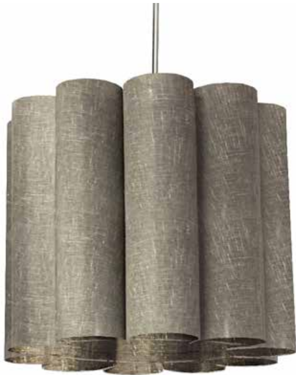
1 Light Sandra Pendant Milano Grey Polished Chrome

Height 18 Width/Length 19 Depth 19 Weight 3