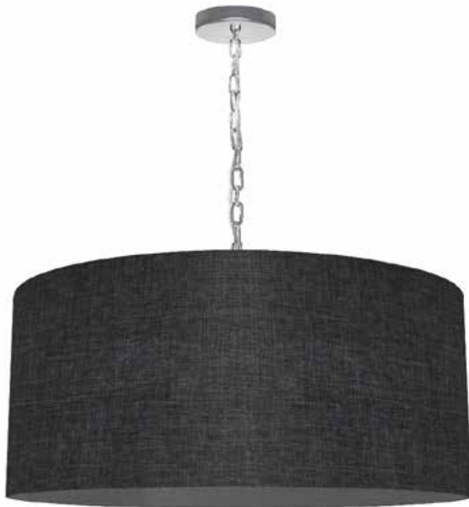
1 Light Large Braxton Polished Chrome Pendant w/ Black/Clear Shade

Height 13 Width/Length 26 Depth 26 Weight 7