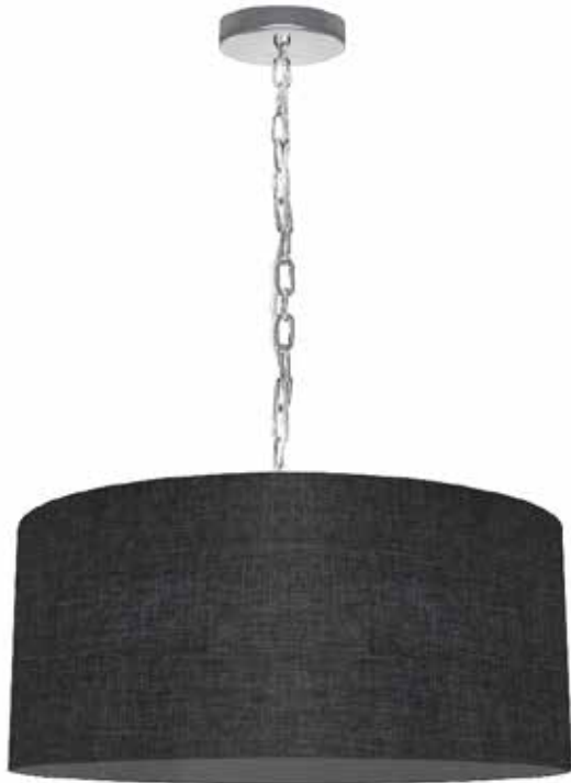
1 Light Medium Braxton Polished Chrome Pendant w/ Black/Clear Shade

Height 10 Width/Length 20 Depth 20 Weight 5