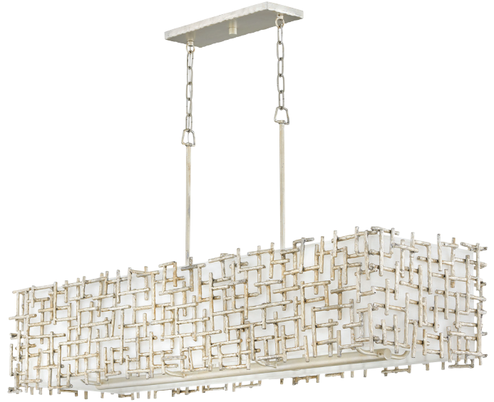
FR33105SLF [ 48.25" W, 23.75" H, 14" D ]