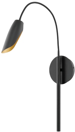
FR35800BLK [ 4.75" W, 32.5" H ]

INSPIRED BY KINETIC ARTISTRY | CONTEMPORARY LED MOBILE DESIGN | ROTATING ARMS AND ARTICULATING HEADS | BLACK FINISH WITH BANKER BRASS INSIDE ACCENT FINISH