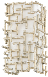
FR33102SLF [ 7" W, 11.25" H ]