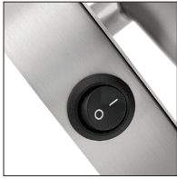
wall sconce features an on/off switch

INSPIRED BY KINETIC ARTISTRY | CONTEMPORARY LED MOBILE DESIGN | ROTATING ARMS AND ARTICULATING HEADS | BRUSHED NICKEL FINISH WITH BRIGHT WHITE INSIDE ACCENT FINISH