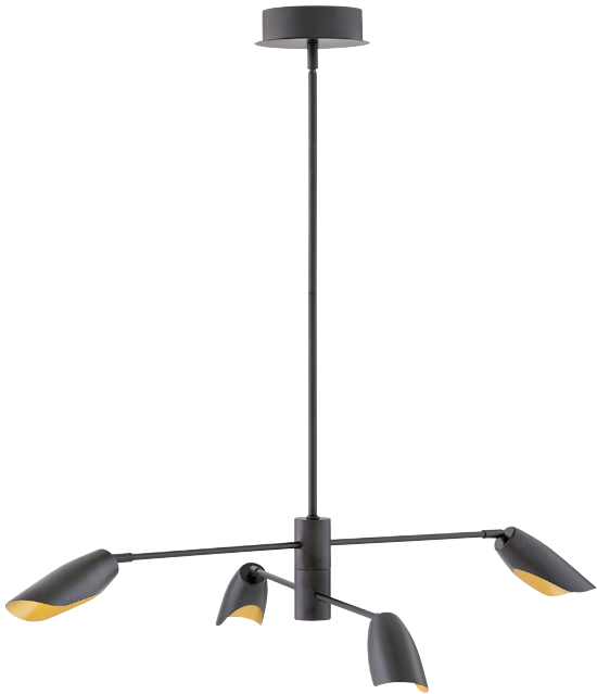
FR35804BLK [ 39.25" DIA., 6" H ]