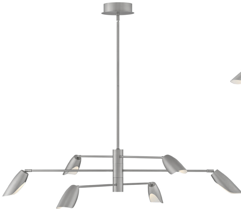
FR35806BNI [ 50" DIA., 8.25" H ]

FR35800BNI width, height, extension and top to outlet dimensions vary based on installation preferences.