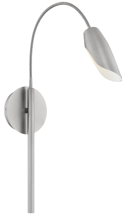
FR35800BNI [ 4.75" W, 32.5" H ]