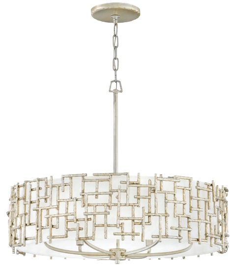
FR33104SLF [ 28" DIA., 23.25" H ]

Farrah chandeliers are provided with 12' of wire and 10' of chain.