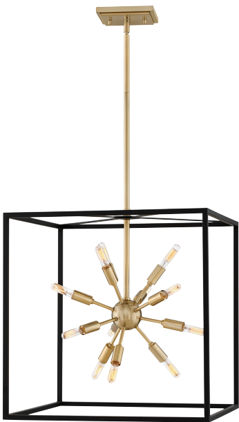
46314BLK [ 20" SQ., 21" H ]

Aros fixtures are provided with 10' of wire and the following stems: (1) 6", (2) 12"