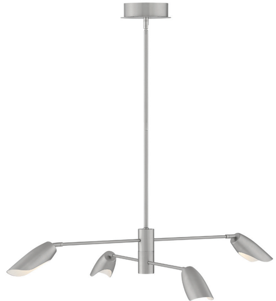
FR35804BNI [ 39.25" DIA., 6" H ]