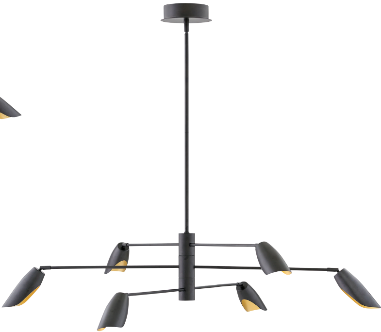
FR35806BLK [ 50" DIA., 8.25" H ]

FR35800BLK width, height, extension and top to outlet dimensions vary based on installation preferences.