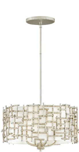
FR33103SLF [ 16" DIA., 8" H ]