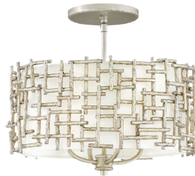
FR33103SLF [ 16" DIA., 14.5" H ] mounted close to ceiling