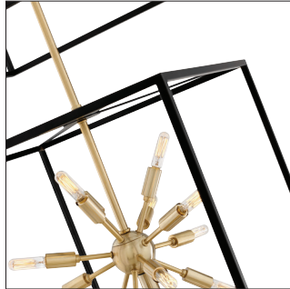
ON THE COVER: AROS, LISA MCDENNON COLLECTION | PAGE S130