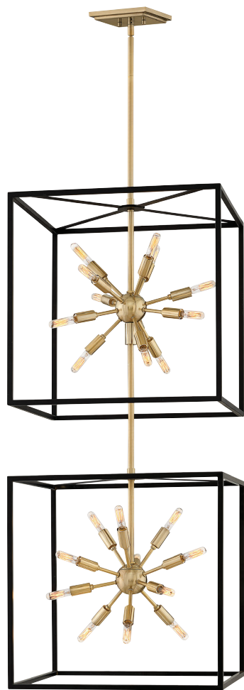
46316BLK [ 20" SQ., 51.5" H ]