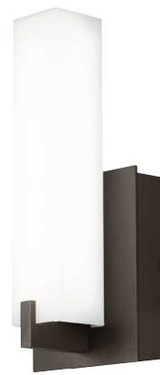
COSMO 12 shown in bronze

* Visit techlighting.com for specific warranty limitations and details.