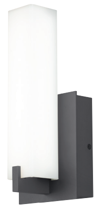
COSMO 12 shown in charcoal