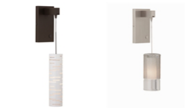
antique bronze satin nickel shown shown with revel with manchon (not (not included) included)