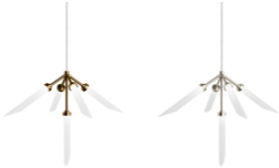
frost / aged brass frost / satin nickel