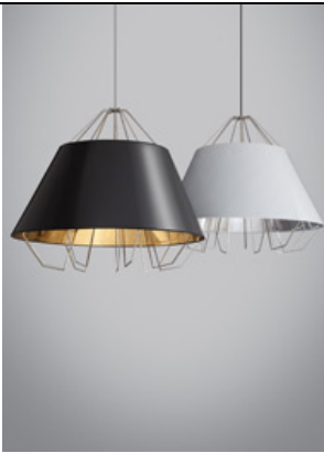
gloss black-gold shade