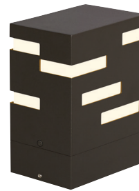
REVEL PATH shown in bronze