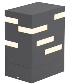
REVEL PATH shown in charcoal