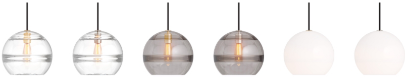
clear/ aged brass clear/ satin nickel smoke / aged brass smoke / satin nickel white / aged brass white / satin nickel